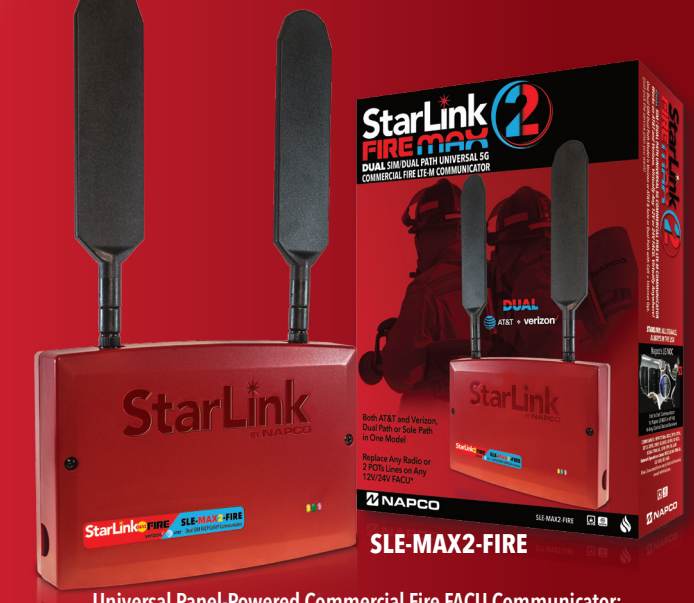
Universal Panel-Powered Commercial Fire FACU Communicator: Dual SIM for 2 Networks; Dual Path Cell Only or Cell/IP All in One Model verizon 🗸 📚 AT&T

One Dual SIM Dual Path Model is Both Verizon and AT&T and Sole or Dual Path with Cellular + Internet Option. StarLink Fire provides full data reporting, in sole & dual path, as a primary or backup, to any central station of your choice, w/o requiring any special equipment. Super Dual<sup>™</sup> Exclusive Supervised Dual Cell, Dual Path Plan Option (w/o using IP) Industry's 1st UL 864 Listed Supervised Dual Sim, Dual Path Communications -Uses 2 cell networks; both carrier channels are supervised. If one network is down, the other will be on. UL 864 Listed Dual Supervised, Dual Cell Channels, avoids use of IP for AHJ/regions' dual path requirement. A selectable plan option on NapcoComnet.com