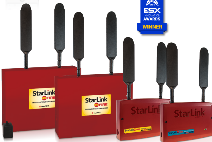
StarLink Max Fire 5G LTE-M code-compliant standard or metal models on choice of Verizon or AT&T networks