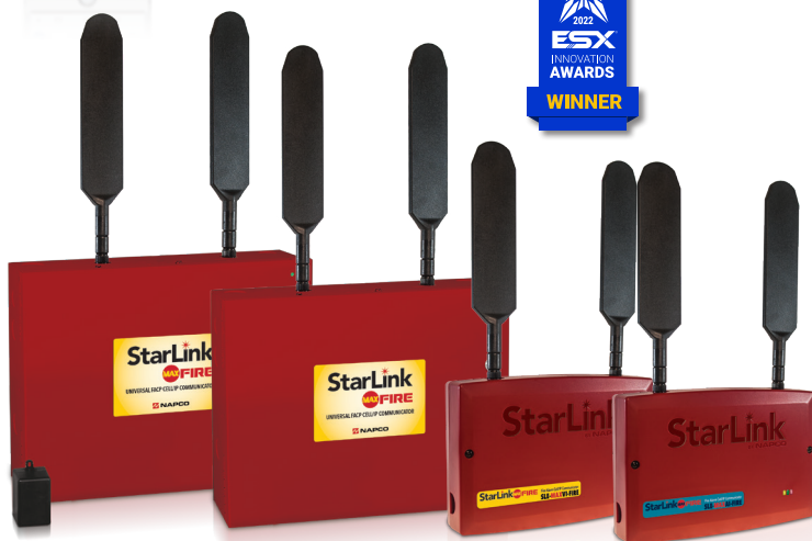
StarLink Max Fire 5G LTE-M code-compliant standard or metal models on choice of Verizon or AT&T networks